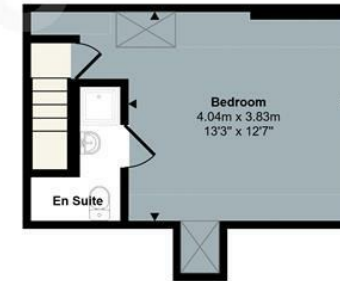
Second Floor Approx 23 sq m / 246 sq ft

This floorplan is only for illustrative purposes and is not to scale. Measurements of rooms, doors, windows, and any items are approximate and no responsibility is taken for any error, omission or mis-statement. Icons of items such as bathroom suites are representations only and may not look like the real items. Made with Made Snappy 360.